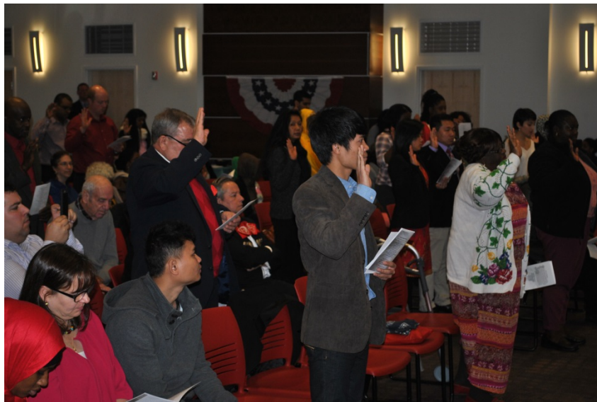
New citizens taking the Oath of Allegiance

The citizenship ceremony was also enriched by the participation of local Hartford youth.