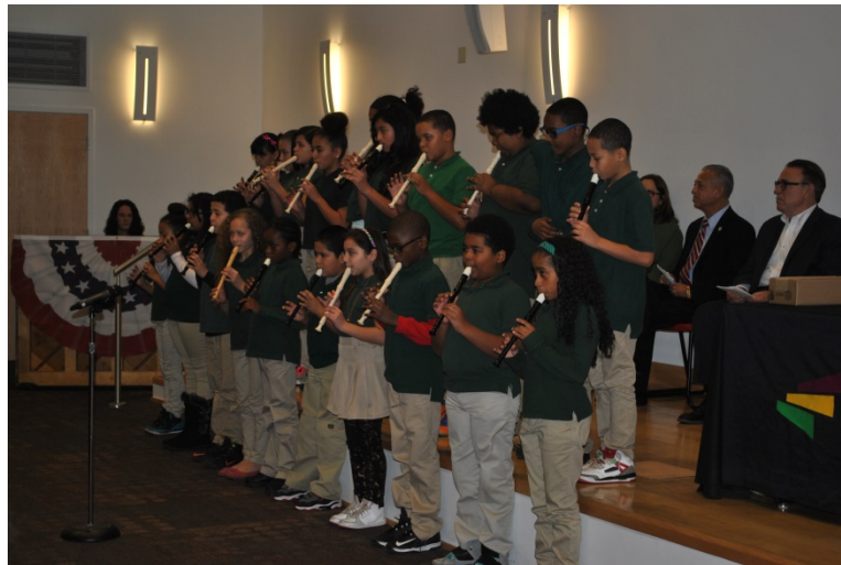
Batchelder Elementary School