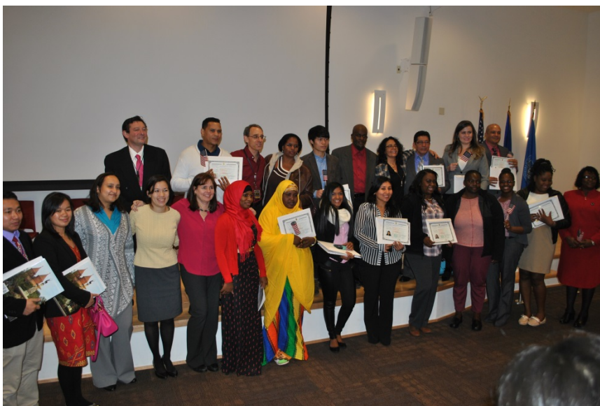
New U.S. citizens and HPL American Place staff celebrate citizenship!

home to 16 of these new citizens, all of whom benefitted from library services of English language and citizenship classes, application support, or intensive tutoring in preparation for the citizenship interview.